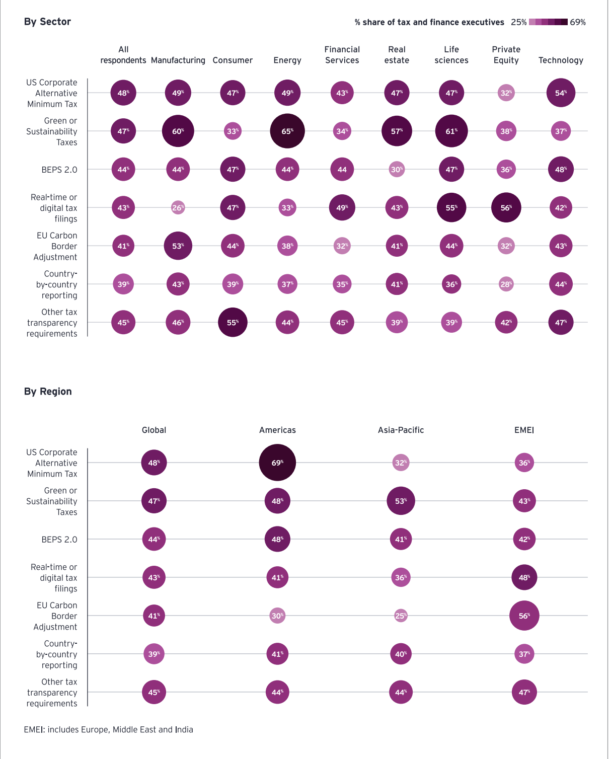
Figure 3A: The impact of emerging reporting requirements on tax and finance functions varies by sector and region Respondents that say new or emerging reporting requirements will have a significant impact on their tax and finance function

Even as tax functions brace for sweeping reforms unfolding around the world as governments implement the BEPS 2.0 global minimum tax rules, they are dealing with a plethora of ongoing tax legislative and regulatory complexities. These include the US corporate alternative minimum tax, green and sustainability taxes, a sharp uptick in formal and informal requests for information from tax authorities and increasing demands for digital filings containing realtime transactional information. Other challenges include complying with the EU Carbon Border Adjustment Mechanism (CBAM) and filing country-by-country reports with multiple jurisdictions.