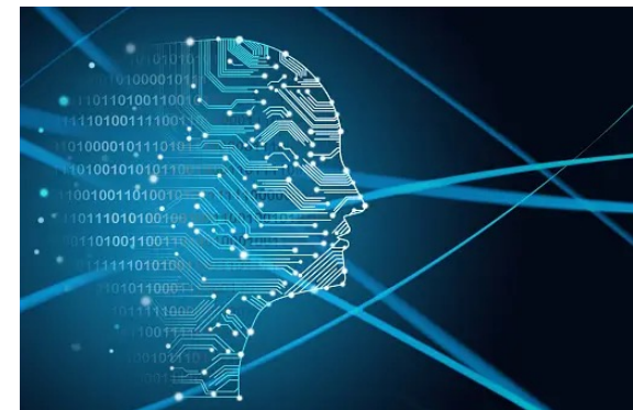
The deep tech revolution