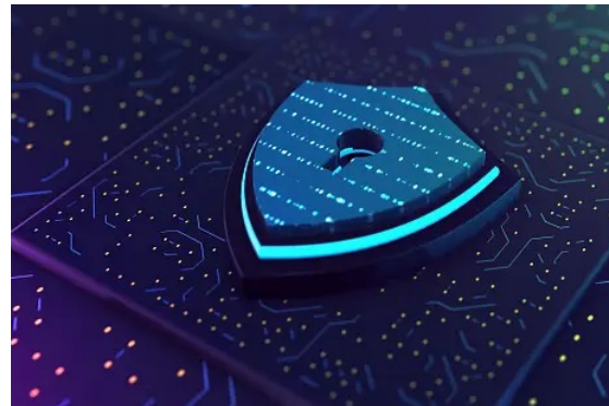
The future of security and data