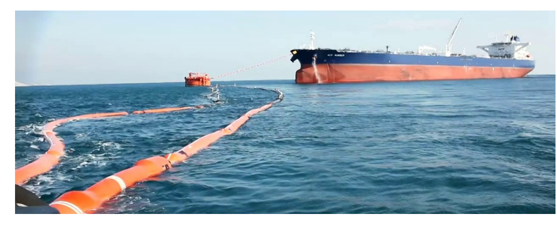
Single Point Mooring (SPM) operations