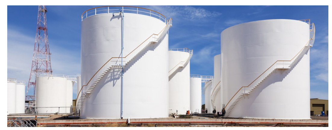
Fuel Tank Farm to be built