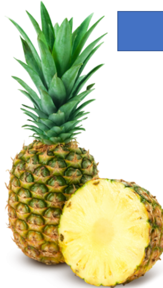
Phytophthora rot in MD2 pineapple