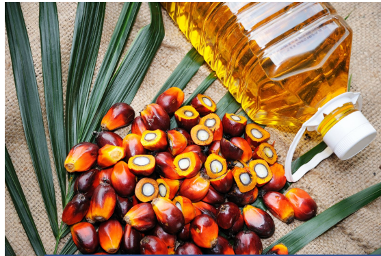
Oil Palm Nursery