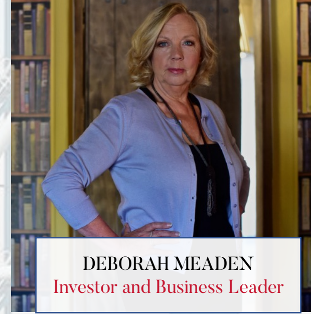
DEBORAH MEADEN Investor and Business Leader